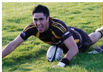
Photos above taken at the Ipswich v Old Streetonians match on 30th October. Ipswich 48 Old Streetonians 19

For match reports visit www.ipswichrugby.com