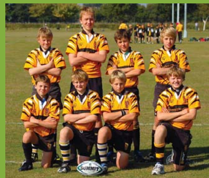
Eight of the Ipswich U13's squad are members of the prestigious Eastern Counties School of Rugby